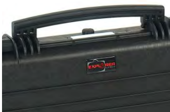
LARGE FRONT HANDLE

Internal slots for optional panel mounting brackets or panel mounting rings