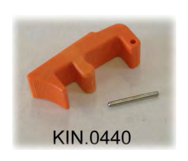
Latch for models from 1908 to 2214