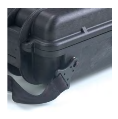
OPTIONAL SHOULDER STRAP (universal) (art. SHOULDERKIT.U)