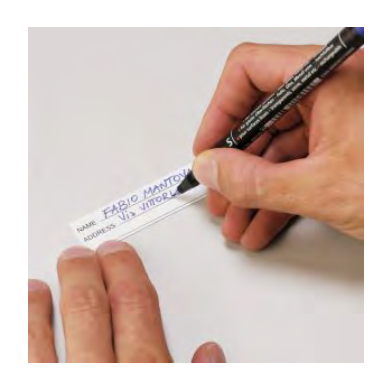
PVC WATERPROOF I. D. REMOVABLE LABEL (Art. LABELCOVER + nr. art.)

The internal stop ring prevents valve from being completely extracted (Art. PURGEVALVE.B)