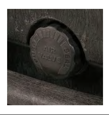
MANUAL PRESSURE RELEASE VALVE

The internal stop ring prevents valve from being completely extracted (Art. PURGEVALVE.B)