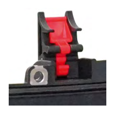
PULL RELEASE LATCH New pull release latch grants additional safety and avoids accidental opening