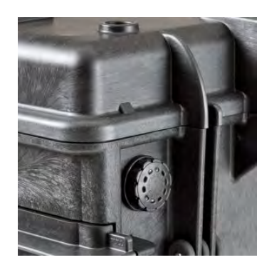
AUTOMATIC PURGE VALVE Automatic pressure release valve.