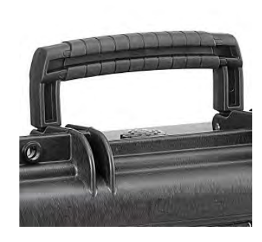
SOFT GRIP HANDLE Load tested handle, reinforced with corrosion proof steel pins