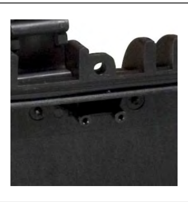
FIXING POINTS Additional fixing points on the lid, available on certain models