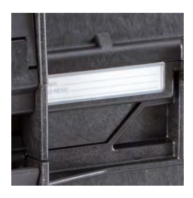
WRITABLE NAME TAG PVC waterproof ID removable label