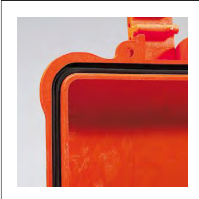
SEALING O-RING (Art. NEOSEAL + nr. art.)