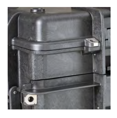
METAL CLIPS Clips metálicos reforzados en los principales puntos para candados.