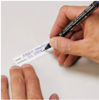
PVC WATERPROOF I. D. REMOVABLE LABEL (Art. LABELCOVER + nr. art.)