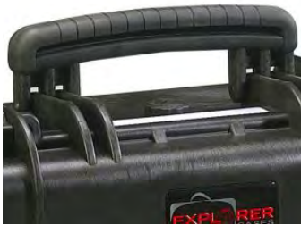
SOFT GRIP RUBBER HANDLE Asa de carga comprobada, reforzada con pasadores de acero a prueba de corrosión