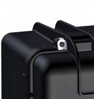
STAINLESS STEEL REINFORCED PADLOCKABLE POINTS WITH CLIPS 4 stainless steel clip-covers on the two frontal outer padlock points, to grant a better resistance to abrasion.