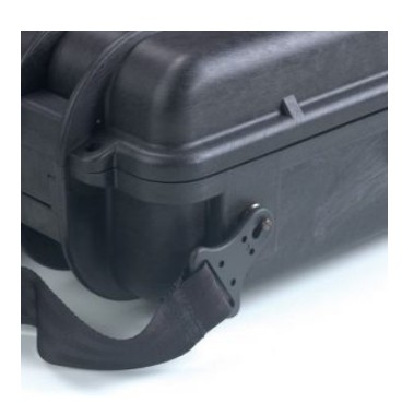
OPTIONAL SHOULDER STRAP (universal) (art. SHOULDERKIT.U)