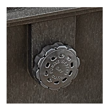
AUTOMATIC VALVE Automatic pressure release valve.