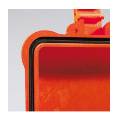
SEALING O-RING (Art. NEOSEAL + nr. art.)