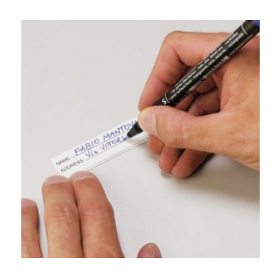
PVC WATERPROOF I. D. REMOVABLE LABEL (Art. LABELCOVER + nr. art.)