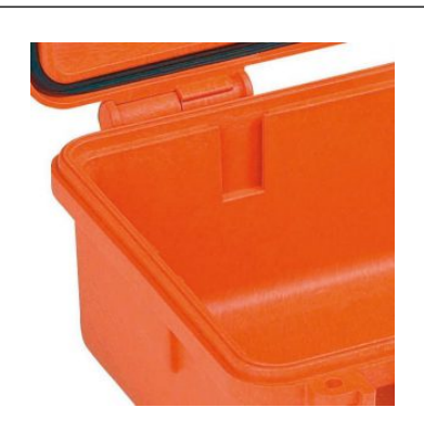
INTERNAL SLOTS Internal slots for optional panel mounting brackets or panel mounting rings