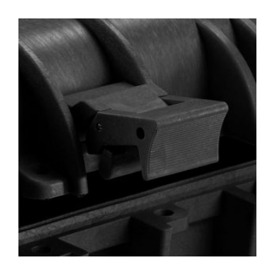
JAM FREE LATCHES WITH EASY-OPENING MECHANISM (from model 3818 on)