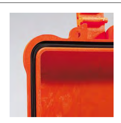
SEALING O-RING (Art. NEOSEAL + nr. art.)