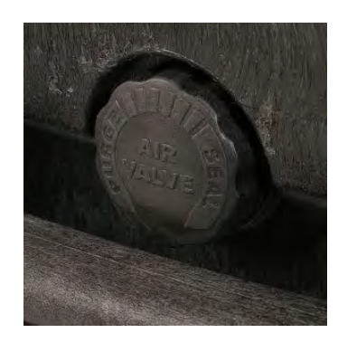
MANUAL PRESSURE RELEASE VALVE The internal stop ring prevents valve from being completely extracted (Art. PURGEVALVE.B)