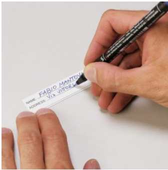
PVC WATERPROOF I. D. REMOVABLE LABEL (Art. LABELCOVER + nr. art.)