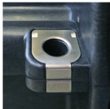
STAINLESS STEEL REINFORCED PADLOCKABLE POINTS 4 stainless steel clip-covers on the two frontal outer padlock points, to grant a better resistance to abrasion.