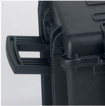
TWO MAN LIFT SIDE HANDLES