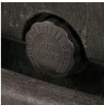
MANUAL PRESSURE RELEASE VALVE The internal stop ring prevents valve from being completely extracted (Art. PURGEVALVE.B)