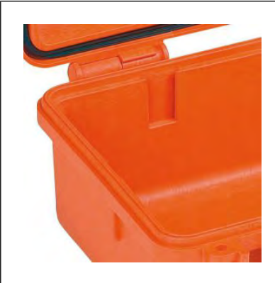
INTERNAL SLOTS Internal slots for optional panel mounting brackets or panel mounting rings