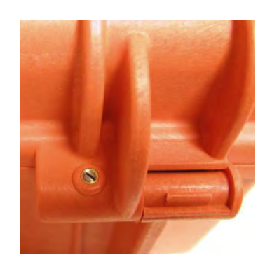
LID CAN BE SET TO SLIDE-OFF By releasing the back screw, lid becomes set to slide-off when opened at 70°