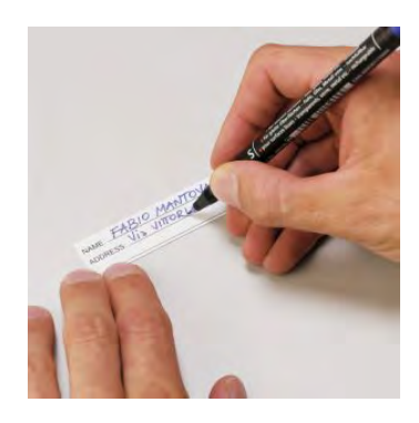
PVC WATERPROOF I. D. REMOVABLE LABEL (Art. LABELCOVER + nr. art.)

The internal stop ring prevents valve from being completely extracted (Art. PURGEVALVE.B)