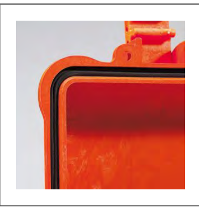
SEALING O-RING (Art. NEOSEAL + nr. art.)