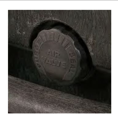
MANUAL PRESSURE RELEASE VALVE

The internal stop ring prevents valve from being completely extracted (Art. PURGEVALVE.B)