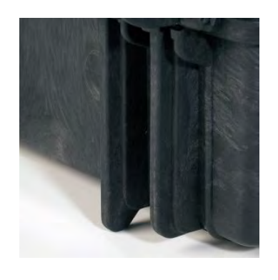
COUNTERBALANCE SUPPORTS (in certain models)