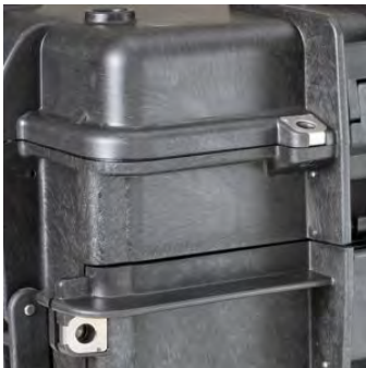
METAL CLIPS Clips metálicos reforzados en los principales puntos para candados.