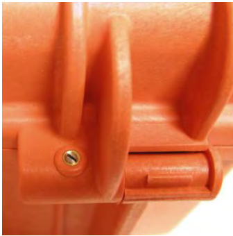
LID CAN BE SET TO SLIDE-OFF By releasing the back screw, lid becomes set to slide-off when opened at 70°