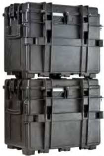
ABILITY TO STACK The special design of the bottom and the lid feet, grants a perfect stackability.