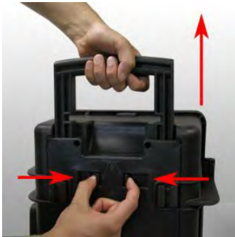
EASY TO OPEN RELEASE TELESCOPIC HANDLE (model 5122)