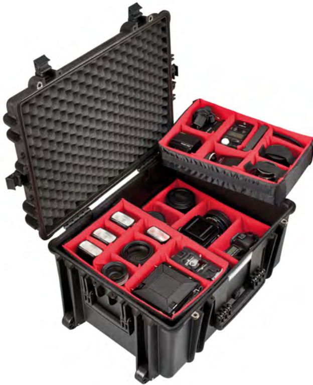
Photo cases made in injection molded PP material. Equipped with three padded dividers sets to store professional camera gears.