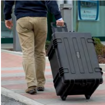
WHEELS AND TELESCOPIC HANDLE (model 5833)