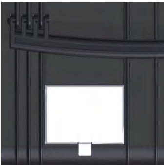
SHIPPING LABEL HOLDER (7745)

4 stainless steel clip-covers on the two frontal outer padlock points, to grant a better resistance to abrasion.