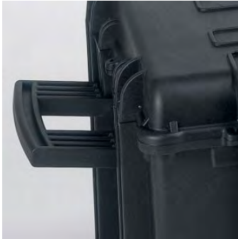
TWO MAN LIFT SIDE HANDLES