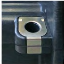
STAINLESS STEEL REINFORCED PADLOCKABLE POINTS

4 stainless steel clip-covers on the two frontal outer padlock points, to grant a better resistance to abrasion.