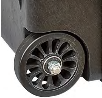
SELF OILING FREE RUNNING WHEELS