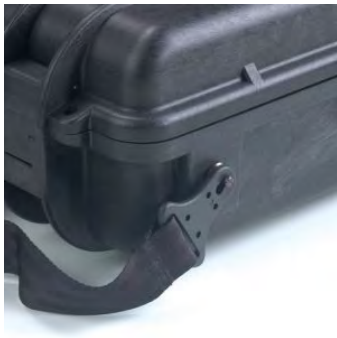
OPTIONAL SHOULDER STRAP (universal) (art. SHOULDERKIT.U)