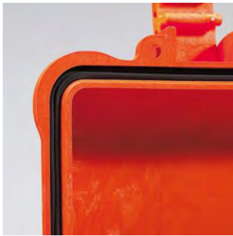
SEALING O-RING (Art. NEOSEAL + nr. art.)