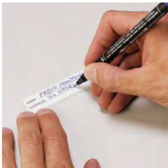
PVC WATERPROOF I. D. REMOVABLE LABEL (Art. LABELCOVER + nr. art.)