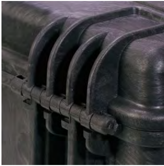
CORROSION PROOF METAL HINGES WITH LID STAY FEATURES