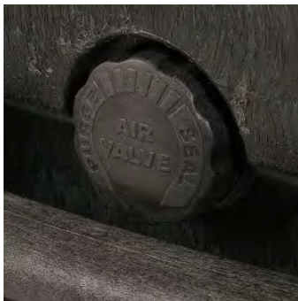
MANUAL PRESSURE RELEASE VALVE The internal stop ring prevents valve from being completely extracted (Art. PURGEVALVE.B)