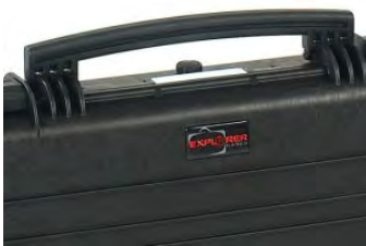
LARGE FRONT HANDLE

Internal slots for optional panel mounting brackets or panel mounting rings